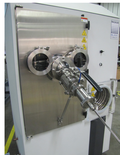
Spider L/XL mounted on SS door