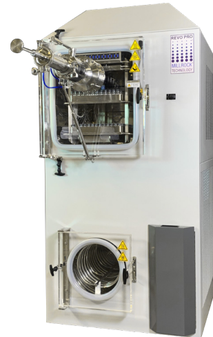
Standard Spider Sample Extractor mounted on full view acrylic for maximum visibility

The Spider comes standard with a removable extraction rod that can be stored when not in use. This provides additional room as well as safety. Without the extraction rod, the remainder of the extractor extends only 10" from the door. The Sample Extractor design does not require an additional vacuum pump. The Millrock sample extractor provides a simple, elegant design with minimal sealing surfaces to help eliminate leaks. For use with vials up to 100 ml, Millrock offers the Spider L or XL.