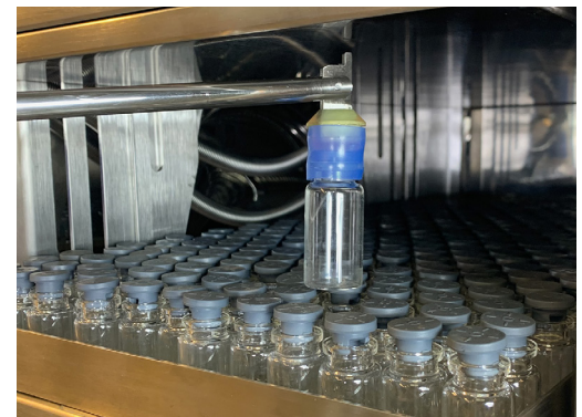
Spider L/XL grabber shown with caged support for maximum grip (100ml serum vials shown)