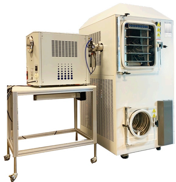
FreezeBooster NS20 (portable) attached to a REVO® Pro Lab

The Millrock FreezeBooster is a stand-alone module that can be attached to almost any laboratory freeze dryer. It does not require that the dryer have ASME rated chambers for high pressure and works within the parameters that the normal laboratory lyophilizer is designed for.