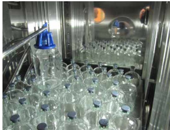
Spider™ L/XL grabber shown with caged support for maximum grip (100ml serum vials shown)