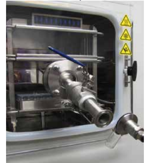
Standard Spider™ Sample Extractor mounted on full view acrylic for maximum visibility