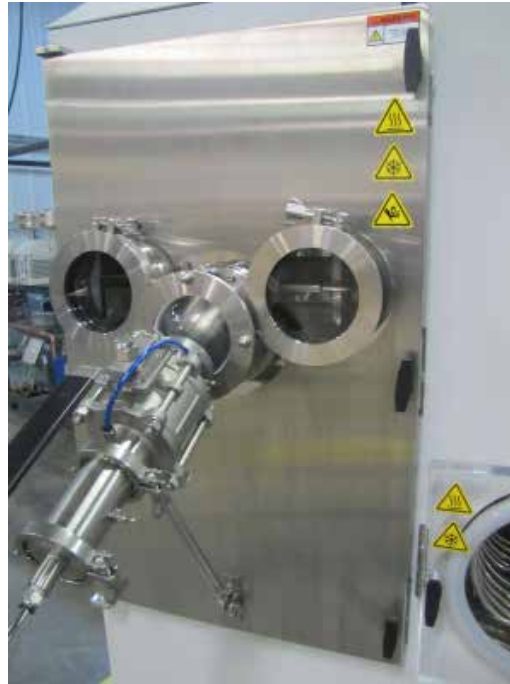
Spider™ L/XL mounted on SS door as shown above

For use with vials up to 100 ml, Millrock offers the Spider™ L or XL.